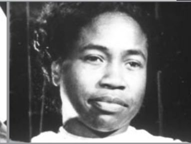
... Lorraine Hansberry