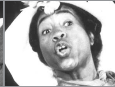
... Zora Neale Hurston