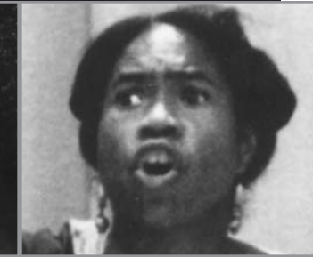
... Maya Angelou