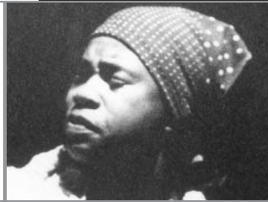
... Harriet Tubman