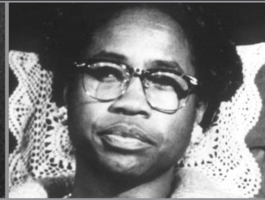
... Mary McLeod Bethune