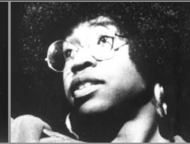
... Angela Davis